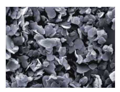
3M<sup>™</sup> Boron Nitride Cooling Filler Platelets (SEM micrograph)